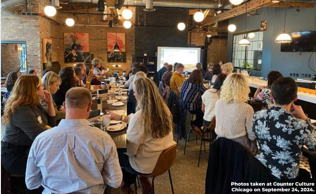
Photos taken at Counter Culture Chicago on September 24, 2024.